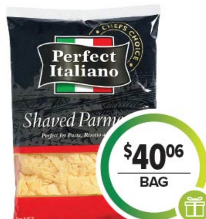
PERFECT ITALIANO SHAVED PARMESAN CHEESE 1KG (106026)