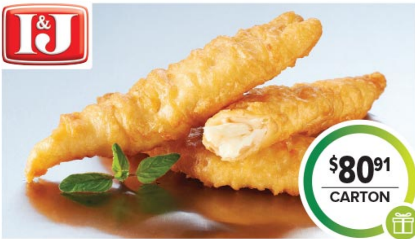
I&J CRISPY BATTERED FLATHEAD 3KG (45631)