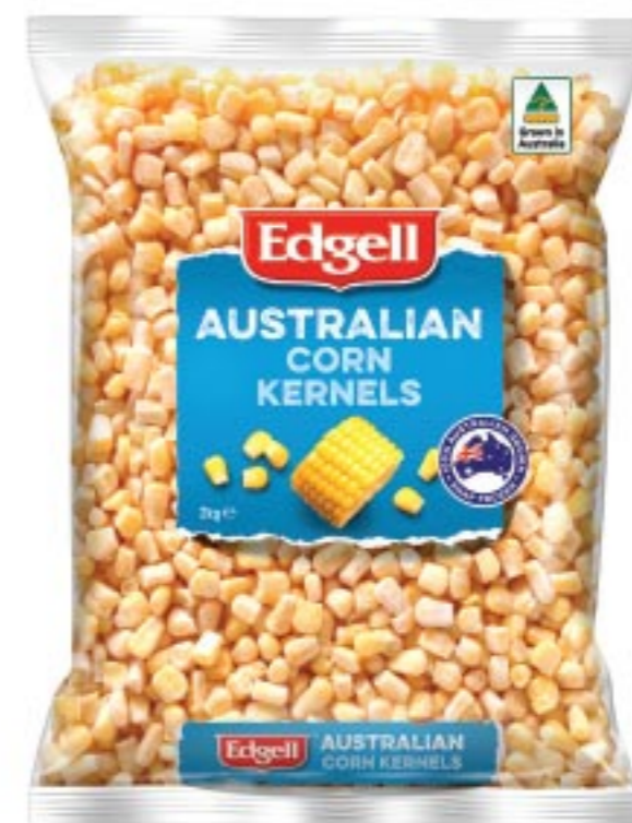
EDGELL CORN KERNELS 2KG (40242)