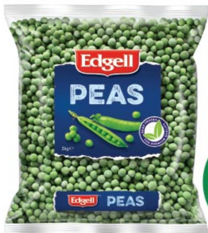
EDGELL PEAS 2KG (40009)