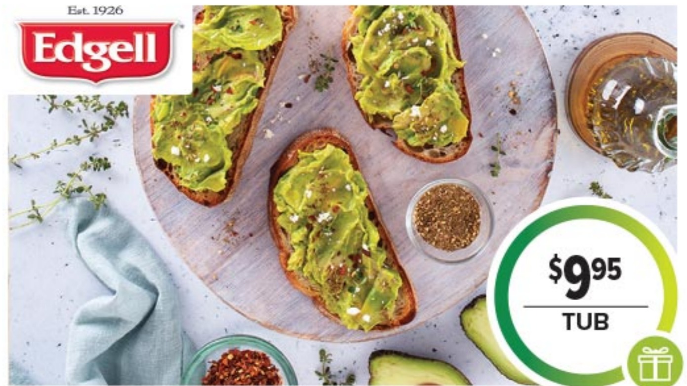
EDGELL CHUNKY AVOCADO PULP 454GM (12475)