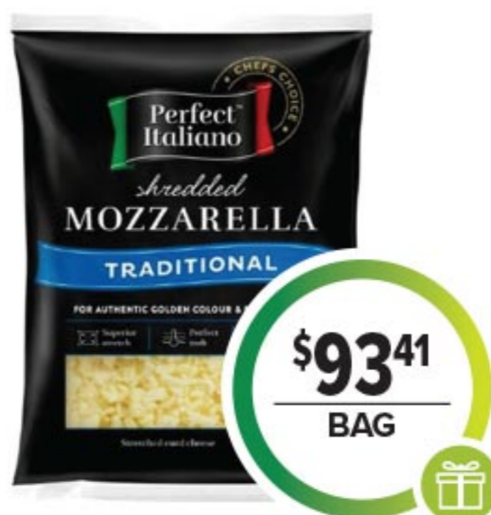
PERFECT ITALIANO SHREDDED MOZZARELLA 6KG (3000877)