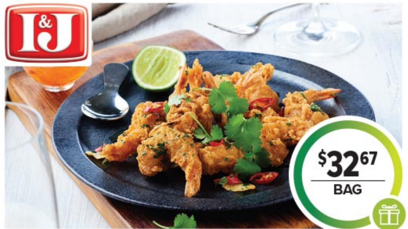
I&J DOUBLE CRUNCH SALT & PEPPER PRAWNS 1KG (12184)