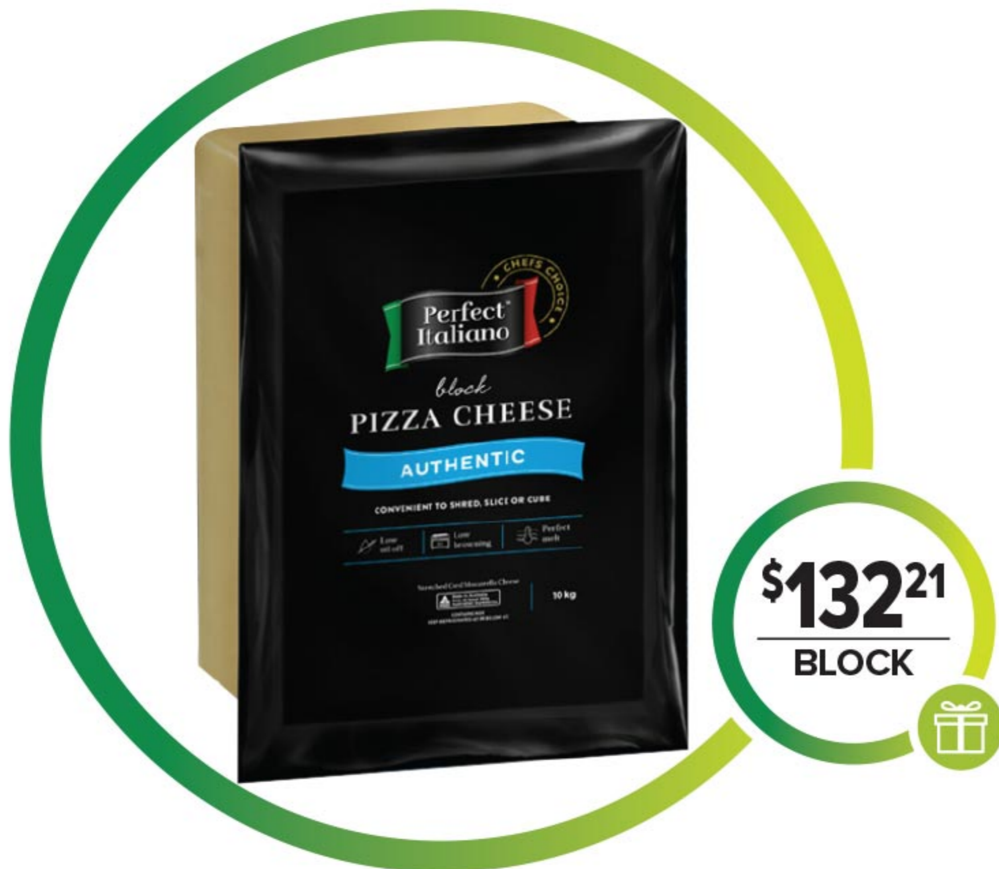
PERFECT ITALIANO BLOCK PIZZA CHEESE 10KG (3112294)

ADVERTISED SPECIALS AVAILABLE FOR THIS MONTH ONLY WHILE STOCKS LAST | PRICES EXCLUDE GST