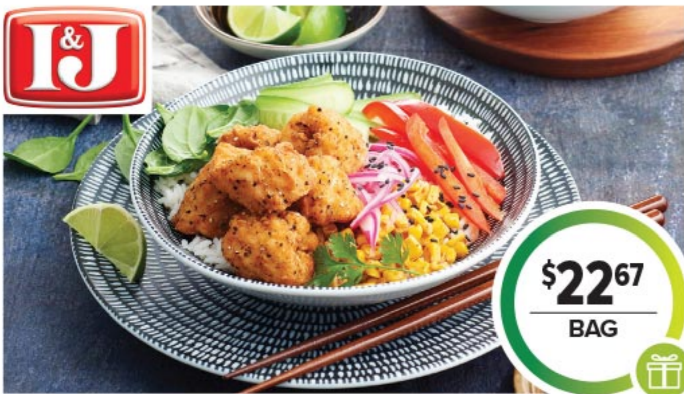
I&J SALT & CRACKED BLACK PEPPER SQUID 1KG (12422)