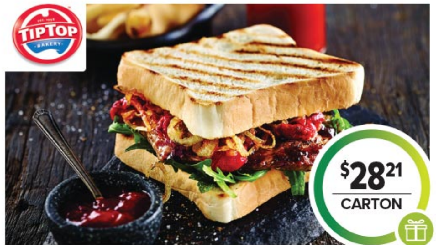
TIP TOP FOODSERVICE WHITE SUPER THICK SLICED BREAD 700GM X 6 (9326)