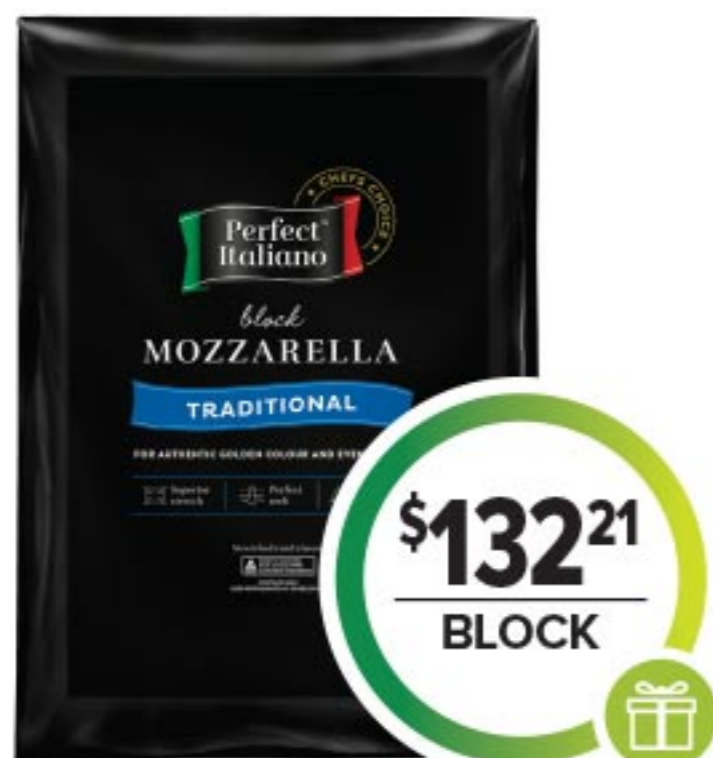
PERFECT ITALIANO BLOCK MOZZARELLA 10KG (3112421)