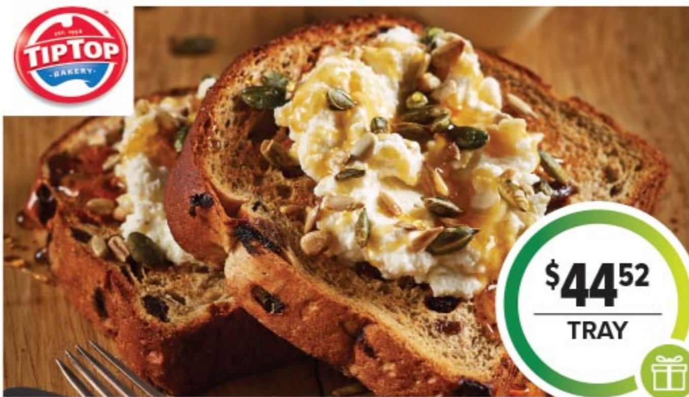
TIP TOP SUPER THICK SLICED RAISIN BREAD 650GM (9327)